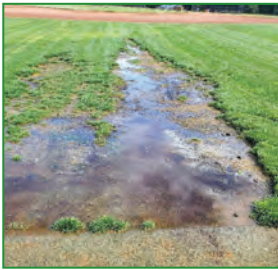
Windemere Ranch Cricket Pitch