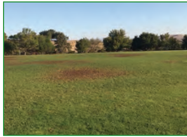
Old Ranch Park