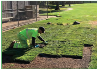
Athan Downs Baseball Field