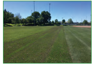
Central Park Soccer Field #1

This fall, the Public Services Division completed annual sports field renovations at several park sites. Minor renovations at most sites are scheduled annually, with